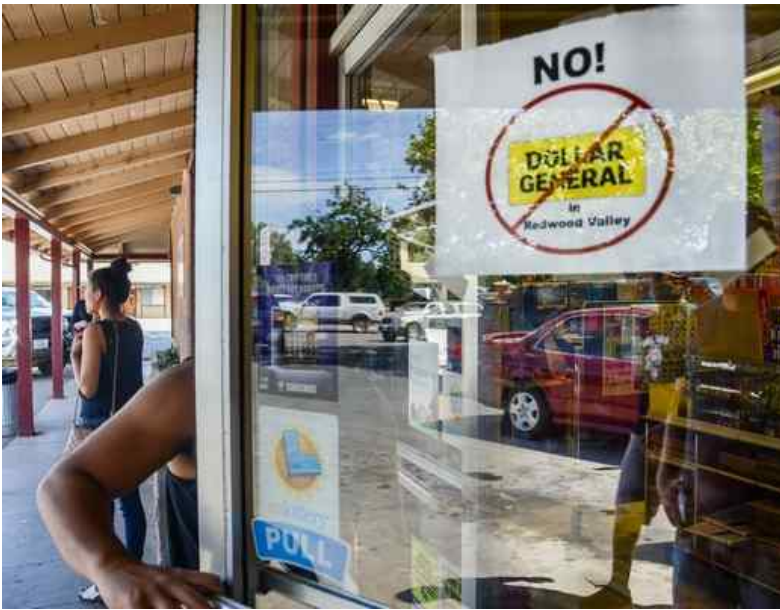
U.S.A. coner store in Redwood Valley actively is against the new Dollar General slated to be developed across the street.