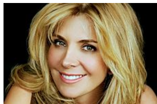
Celebs you didn't know passed away: #17 is Shocking Your Daily Dish