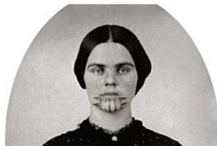
The 1800's Girl With the Tattooed Face Ancestry