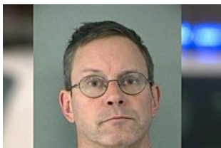
Estranged husband charged with murder Washington Post Video