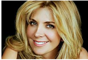
Celebs you didn't know passed away: #17 is Shocking Your Daily Dish