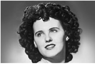
10 Awful Celebrity Deaths socialspinwheel