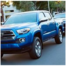
These Are the 2016 Truck Models to Watch Kelley Blue Book