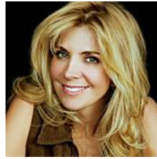
Celebs you didn't know passed away: #17 is Shocking Your Daily Dish