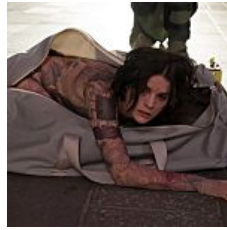
7 New TV Shows That Will Likely Get Another Season The Cheat Sheet